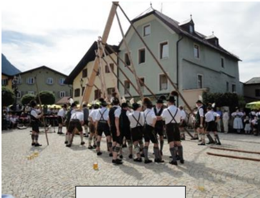
Erecting the tree

However, once the tree is up, nightfall brings the risk of it being stolen by youth groups from neighboring towns. Therefore, it must be watched throughout the night. Should it be stolen nonetheless, it can be redeemed by paying a “ransom” of snacks and drinks. The rules regarding when and by whom the tree may be stolen vary by region, but the tradition is common throughout Austria.