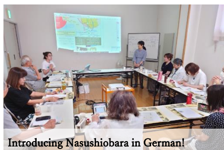
Introducing Nasushiobara in German!