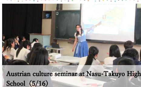
Austrian culture seminar at Nasu-Takuyo High School (5/16)