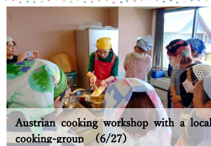
Austrian cooking workshop with a local cooking-group (6/27)