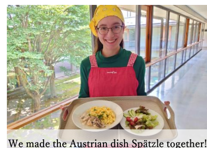
We made the Austrian dish Spätzle together!