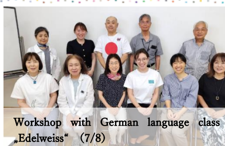
Workshop with German language class „Edelweiss“ (7/8)