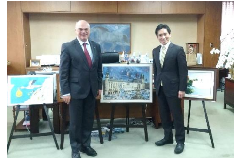
Meeting with Mayor Watanabe (March 2022)

Advantage Austria is Austria’s official TPO (Trade Promotion Organization). We have around 100 offices around the world and help Austrian businesses with their foreign trade. In Japan, we look after nearly 1000 Austrian companies with individual consultation about