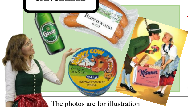
The photos are for illustration purposes only.

The Austrian goods were introduced to us by Advantage Austria