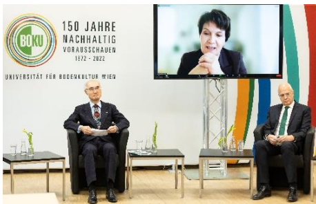
Japanese Ambassador (left), Rector of BOKU University (Center)

The Austrian BOKU University (Universität für B oden k ultur Wien/ University of Natural Resources and Life Sciences, Vienna) has an exchange with Japan in many areas such as natural disasters or chemistry. They have had a partnership with Kyoto University’s Faculty for Agriculture for 30 years. They also work together with Kyoto Prefectural University and Shinshu University. Shinshu University is doing a lot of research in life sciences, sustainability and renewable resources just like BOKU University. They have a program with mutual visits between the universities. There is also a joint research with Tokyo University and Kobe University which has continued for 10 years.