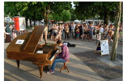
Open Piano for Refugees

The Austrians Nico Schwendinger and Udo Felizeter started the project after they were inspired by a street piano they saw during a visit to Ukraine in 2015. For the “Open Piano for Refugees” they provide a piano at different cities in Europe. Anyone is allowed to play. At that time, they put up a collection box. They use the money that is collected to give music classes to refugees and other people who don’t have the money to pay for music classes.