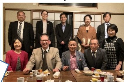
Meeting with the Nasushiobara International Association

(Chairman of the Nasushiobara International Association)