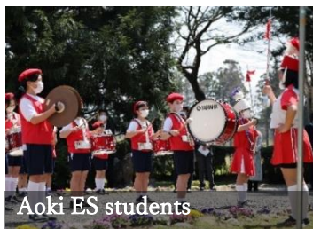
Aoki ES students