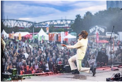
Donauinselfest

In Austria, there are many opportunities to enjoy music for free in Summer. The most famous ones are the open air music festival “Donauinselfest” or the classical “Summer Night Concert” of the Vienna Philharmonic Orchestra at the Schönbrunn Castle in the capital Vienna. There are concerts in Linz too, like the “Musikpavillon” (Wednesday through Sunday from the beginning of June to the middle of August) or the “Linzer Klangwolke” which takes place at the International Brucknerfest Linz. At the festival “Pflasterspektakel”, you can enjoy music and many other kinds of street performances in the old city center. You can really feel the “connecting power” of music in the public space through the project “Open Piano for