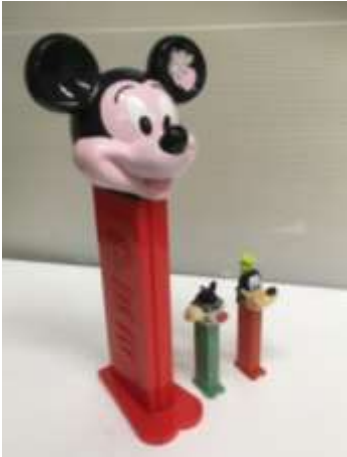
“PEZ”, candy popular amongst children

There are some Austrian things you can find very close to you. The first thing is “PEZ”. It is a candy that is famous for its dispensers with characters’ heads. In 1927, Eduard Haas III (born in Upper Austria) invented rectangular peppermint candy.