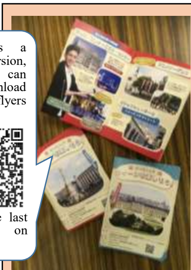
Flyers to introduce Austria: “Linz” and “Vienna”