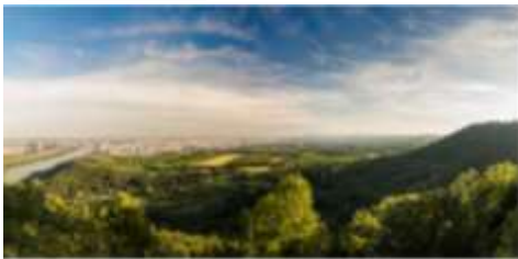
Blick aus dem Wienerwald

Vienna is Austria's capital and also one of the 9 states of Austria. More than 1/5 of the Austrian population lives in Vienna. The city is known for its culture and history, but around 50% of its area are green areas. The public can use 62% of the green areas. In the Wiener Wald forest you can go hiking. I recommend Leopoldsberg and Kahlenberg mountains, from where you have a great view of Vienna. You can reach the top by bus. Another highlight is the nature reserve Lainzer Tiergarten , where you can see the wildlife in its natural surroundings, enjoy the view of Vienna and visit the Habsburg family's country house " Hermesvilla ".