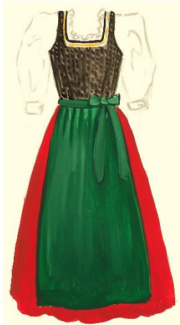
Linz's traditional dress

As for Austrian national costumes, the Dirndl dress for women and Lederhosen leather trousers for men are most well-known. Although there are some traditional costumes with a long history such as the Bregenzerwalder Tracht , which dates back 500 years, most Dirndl are a more recent development. The Trachten (traditional costumes) each have their own characteristic cuts, accessories, fabrics, color schemes, patterns, etc. After “country fashion” became popular amongst the urban populace around the start at the 19th century, the traditional dresses as a set of blouse, dress and apron started developing. The Dirndl has different characteristics such as colors corresponding to different regions. Linz's Dirndl has a top of black silk, a rusty-red wool skirt and a green silk apron. Nowadays, Dirndl with free color combinations and the short “ Minidirndl ” are popular.