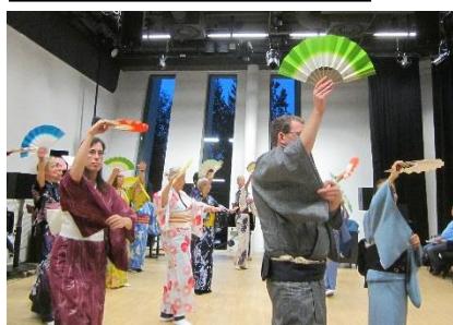
Workshop at Bruckner University